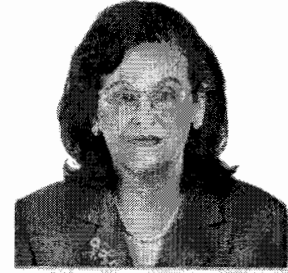
Vice Rector for Academic & Students Affairs Universitas Widyatama