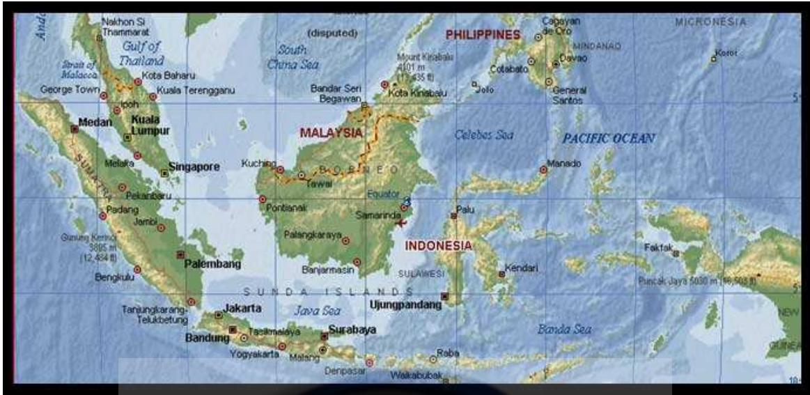
Figure 1 : Location of Bandung in Indonesia

Indonesia has complete main textile industries (upstream to downstream), which consist of this such as industries: fiber, yarn, cloth, and garment. Indonesia has also derivatives textile industries such as: towel, dust-cloth, pillow-case, soc, etc. However, several barriers or problems are still rise toward challenges. This needs more serious attentions from all related stakeholders, especially from Indonesian government because problems in the sector seem not to be only internal company problems but also governmental problem, since industrial challenges have deeply relation with G to G (government to government) policies.