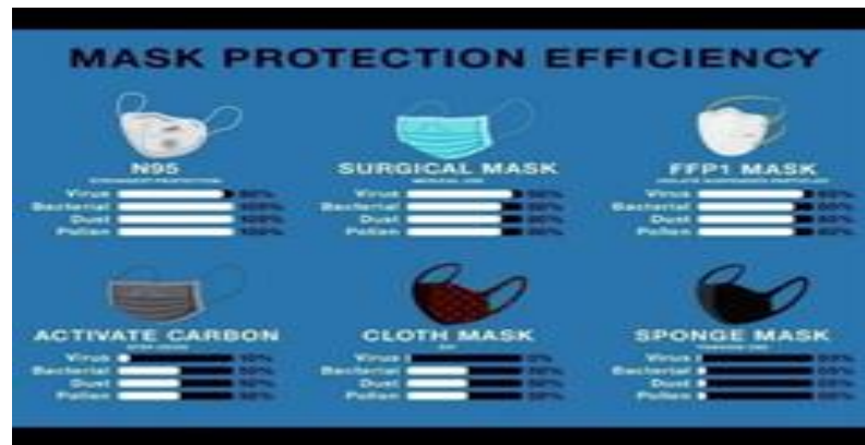
Figure 1. Effectiveness of Types of Masks