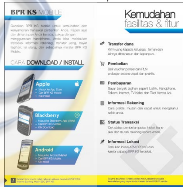
Figure 3. BPR-KS mobile banking facilities and features flyer