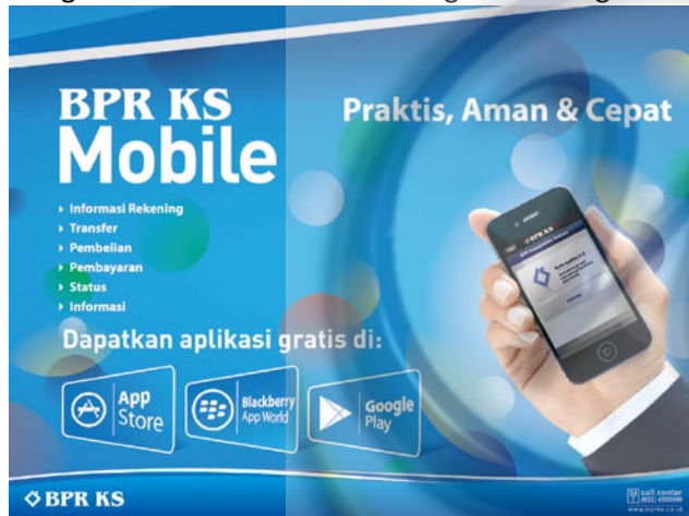
Figure 1. BPR-KS Mobile banking advertising