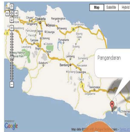
Figure 1. Pangandaran on West Java Map

As seen on Figure 1, Pangandaran tourism area (cited on red bullet highlight) is directly surrounded by Indonesian Ocean at the south-side. It needs about 6-7 hours car/ bus driving from Bandung as capital of West Java Province, or about 300s kilometers in distant. This such condition, of course affects to the number of tourist visit. They would only like to come to Pangandaran tourism area in a quite long weekend or holidays.