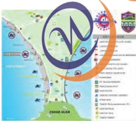
Figures 2. Pantai Timur and Pantai Barat of Pangandaran Tourism Areas

This research focused on study of entrepreneurs' profiles in a tourism area who exist for more than ten year running their business. They are about motivations in creating the business, problems faced during operating of their business and success factors of managing the business. This research hopefully could stimulate growths of SMEs entrepreneurs in Indonesia by generating new entrepreneurs, and could be a consideration for district (and state) government in making appropriate policies or regulations in such tourism areas.