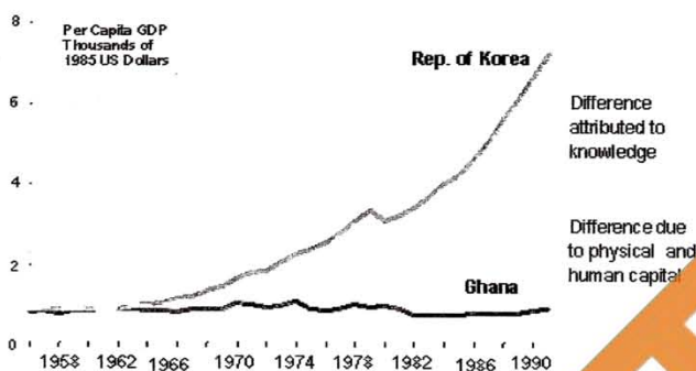
Figure 1 Knowledge as a Key Factor in Economic Development [9]

In economic terms, technology facilitates acceleration in accumulation of knowledge that lead into improvement and growth of economic welfare and development as shown by the herebelow comparative development growth of the nations.