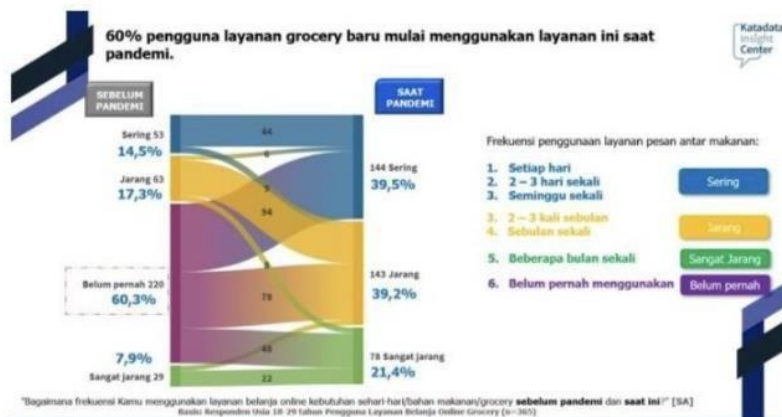
Fig. 2 – Consumer Behavior on Pandemic

Based on these data, it can be seen that the cases that occurred in the city of Bandung at the beginning of the pandemic were fluctuating but tended to increase. This greatly affects various activities in the community. People's movements and activities are also restricted to traveling or shopping to malls or supermarkets. As technology advances, people start shopping online. Online shopping is currently an interesting phenomenon in Indonesia, the following are data on consumer online shopping behavior: