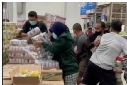
Fig. 3 – Panic Buying Bear Brand Product Situation

With the rise and circulation of videos circulating on social media showing consumers flocking to look for the bear brand milk product. The emergence of news about bear brand milk that can cure and ward off the Covid-19 virus is circulating in news articles. Therefore, people panic because the pandemic is not over, so the panic buying phenomenon occurs, which is a situation where many people suddenly buy food, fuel and so on as much as possible because they are worried that it will last longer.