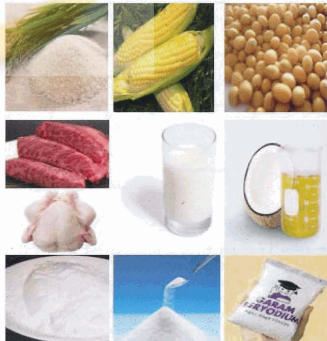
Fig.1. Nine primary commodities in Indonesia.

Rice is popular as a main source of carbohydrate. More than eighty percent Indonesian people eat rice daily though they have others sources of carbohydrates such as potatoes, bread, etc. It is almost un-substitutable source of carbohydrate. Only in an extreme condition, when rice hardly to find such as in a situation of disaster, flooding, etc then Indonesian people would like to consume another source of carbohydrate. Rice can also be used as raw materials in food industries such as rice noodle industry or as glue in textile industries.